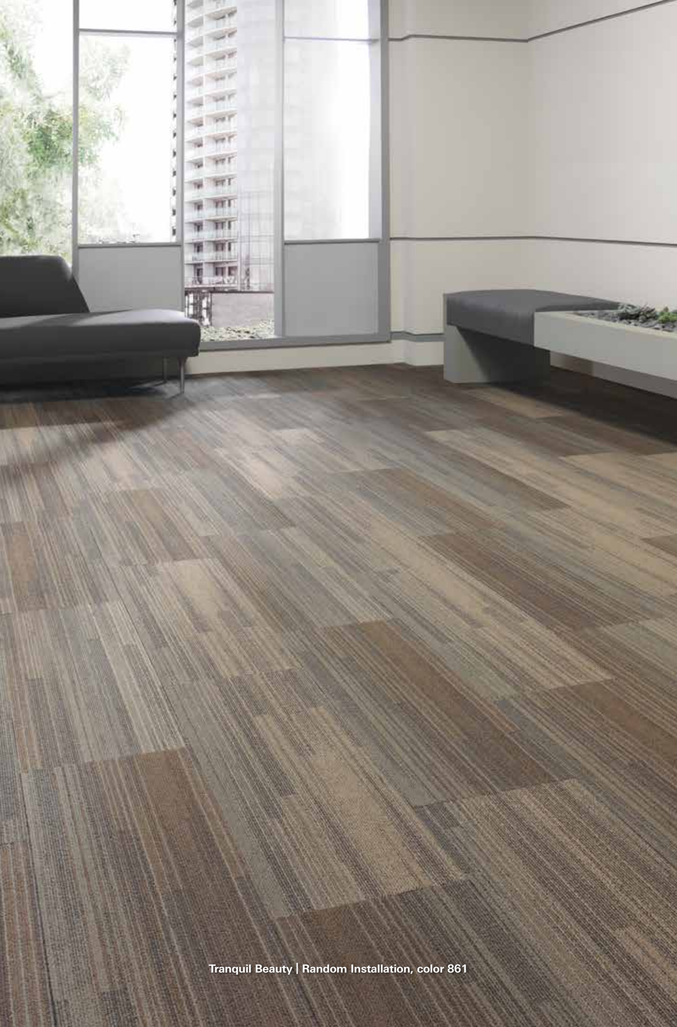
Tranquil Beauty | Random Installation, color 861