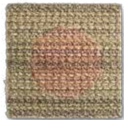
Competitor Solution Dyed / Yarn Dyed Blend