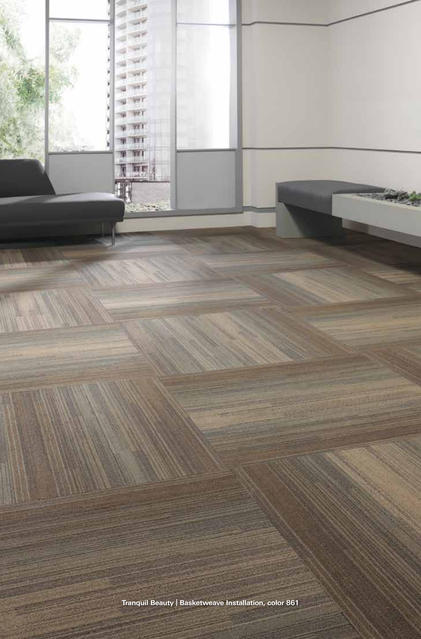
Tranquil Beauty | Basketweave Installation, color 861