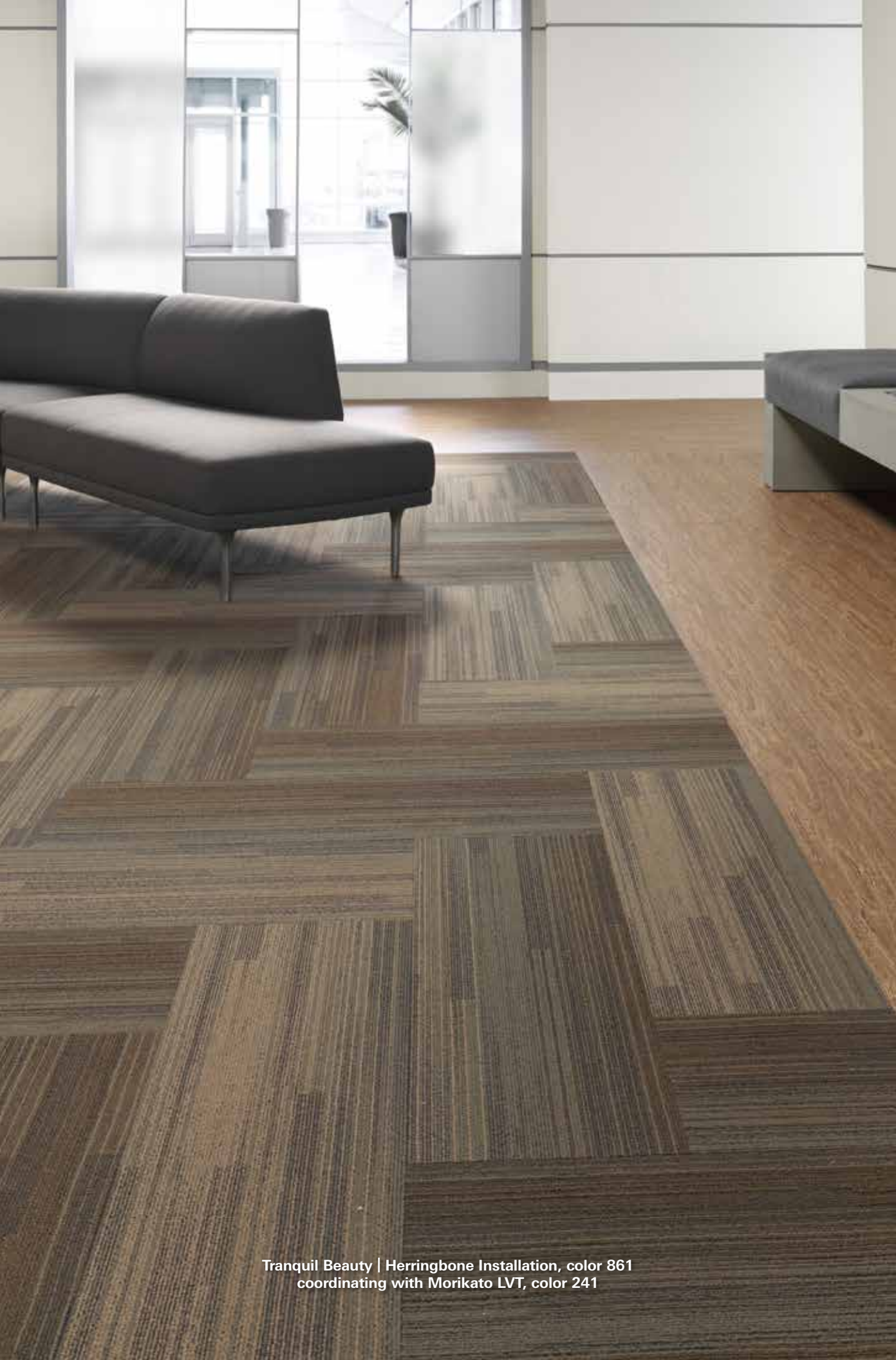
Tranquil Beauty | Herringbone Installation, color 861 coordinating with Morikato LVT, color 241